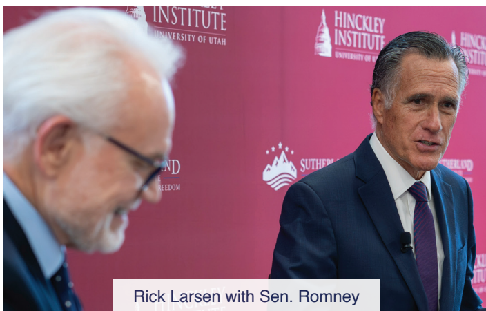
Rick Larsen with Sen. Romney